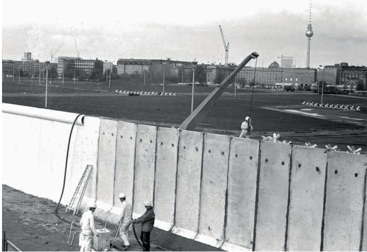
Construction of boundary wall 75 at Potsdamer Platz, ca. April 1976.

The Berlin Wall should have been called the Berlin Walls in reality. Not only that it was expanded and changed in several “generations” since its construction on August 13, 1961. It was also more than just a concrete wall.