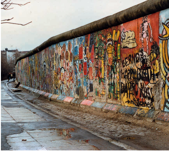
Painted border wall 75 at Behnendamm, circa 1988.