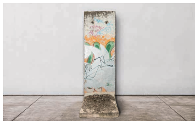
NR. 3 CAP 48