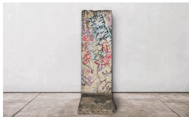
NR. 4 TÉLÉVIE