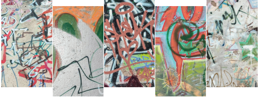
BRAFA 2020's five segments of the Berlin Wall (detail)

The most frequently asked question is: Is this the real Berlin Wall?