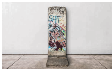
NR. 2 HART VOOR HANDICAP