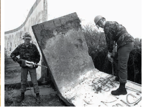
British soldiers demolishing the border wall in the Falkenseer Chaussee / Spandauer Strasse.

The former comrades in the German Democratic Republic could not have imagined that the Berlin Wall would continue to be used even after its existence.