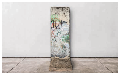
NR. 1 KOM OP TEGEN KANKER