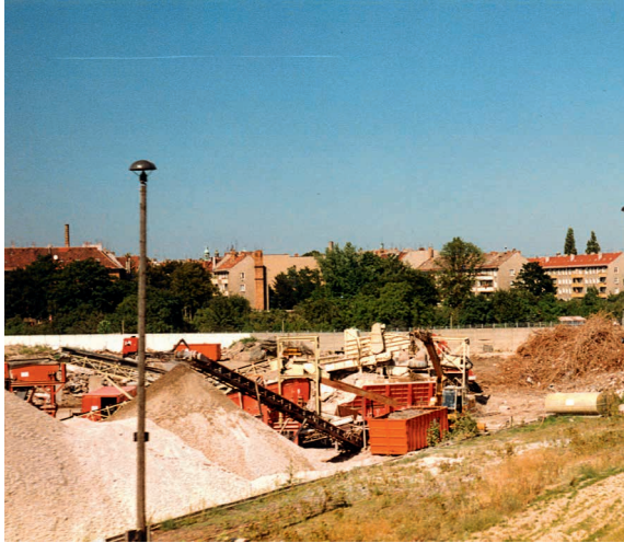
Collection point of wall elements in Pankow, Berlin, 1990.