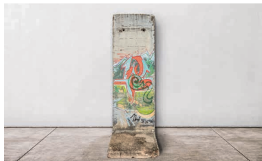
NR. 5 ART & HISTORY MUSEUM